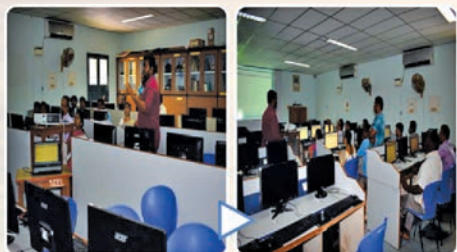
FDP/Short Term Course/Refresher Courses attended by faculty members